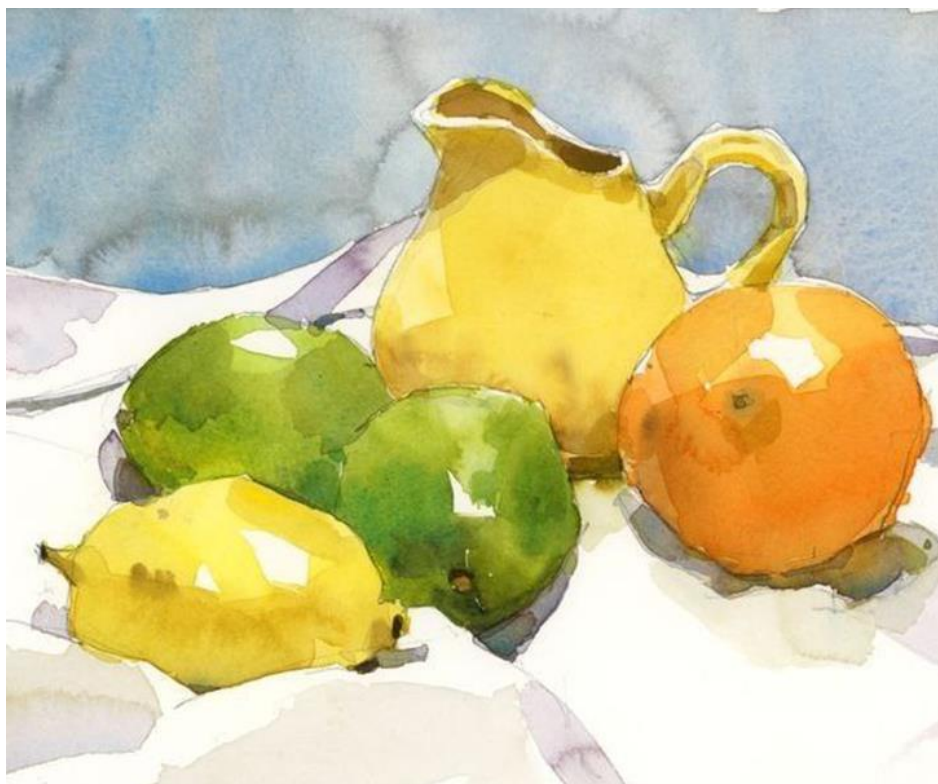
Fig. 1. Still life of fruits with similar colors.

Since the still life is on a white cloth, the wall in the background is also given a light airy color. Usually, light air color is used for the shadow part of white fabrics and objects. That is why the color of the background matches the general color of the still life. As a result, the still life image has an elegant look without excessive dark colors.