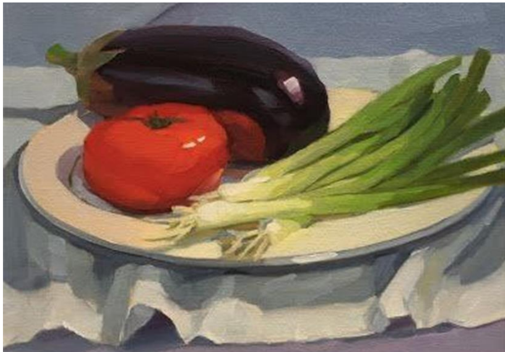
2-picture Contrast rangli mevalar still life.

The reflection of the tomato color, which is relatively dark and warm, is clearly visible on the surface of the eggplant and plate. It was also taken into account that the green color of the eggplant band matches the green color of the onion. Since the general color of the still life is relatively darker, the weight of the vegetables and fruits can be felt because the white fabric and the background are also reflected in a slightly darker color.