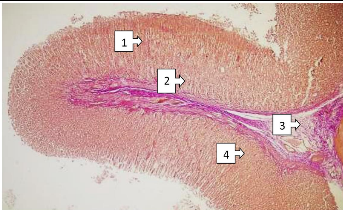
Figure 2. The structure of the stomach wall (body part) of 5-month-old rats. 1 - mucous membrane, 2 - submucosal base, 3 - muscular layer, 4 - glandular tissue of the mucous base. Stained with hematoxylin-eosin. Ok.10xob.4,0.

The body weight of 5-month-old white non-white rats under the influence of polypragmass ranged from -162 g to 241 g. to an average of 218.8 \pm 8.22 gni. The gastric length of the 5-month-old rats in the experiment ranged from -34 mm to 35 mm. to, average -34.32 \pm 0.22 mm. The width of the stomach ranged from -13 mm to -15 mm, with an average of -13.81 \pm 0.22 mm.