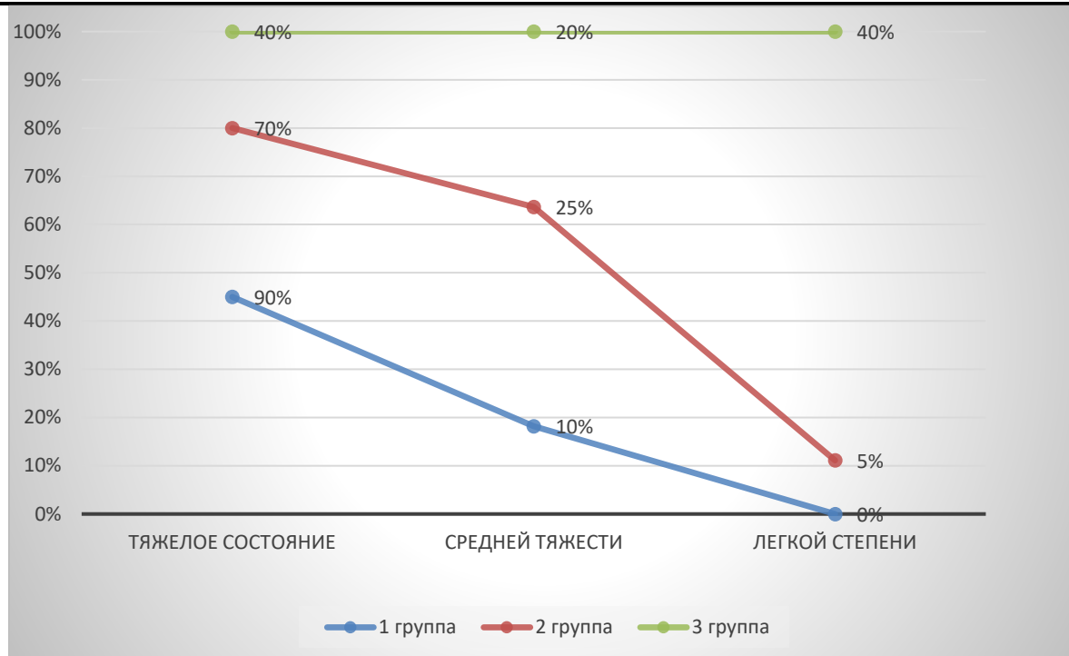
Figure 3. Distribution of newborns in the compared groups according to the severity of the general condition.

The main scale used to determine the assessment of the condition of the newborn and the degree of asphyxia in the child is the Apgar scale. In this regard, during the study, it was found that low scores on the Apgar scale at 1 minute of life were detected in newborns with HIE of all compared groups, but with a greater frequency in newborns of groups 1 and 2 and significantly in relation to both healthy newborns ( p < 0.001 ), and to the group of children with HIE but born with a normal gestational age. Neonatal vital activity indices at the 5th minute of life in the 1st group of the study remained at 1-3 points in 50% of newborns, in group 2 this indicator was only 20%, while all children with normal gestational terms with an assessment of 1-3 points showed improvement states.