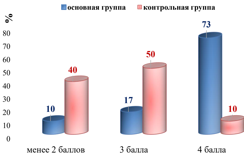
Figure 1. Results of adherence assessment using the Morisky-Green scale in patients after 3 months of therapy.

The number of adherents to therapy was 73% in the main group, while in the control group it was only 10%. Observations of the dynamics of hemoglobin growth in the study groups showed that in the main group there was a higher level of its monthly increase in the blood (Fig. 2). By the end of 3 months, in the main group the hemoglobin level averaged 121 g/l, while in the control group it was 111 g/l.