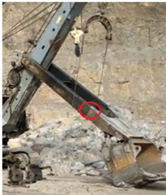
Figure 1. Excavator lever

Today, mining industry is characterized by the development of mining operations in every aspect of the manufacturing industry. Effective, safe, reliable operation of excavators leads to an increase in productivity and a decrease in the cost of minerals. However, excavators, as a result of the impact of forces of tension during exploitation, lead to the failure, exhaustion of excavator working members, a decrease in service life. Fig 1 depicts excavator working members in a chimney, a ledge, an arrow, where the forces of tension falling on the ledge are marked through a red line. Fractures are observed a lot in the specified line of the handle and are determined by accounting work and Ansys programs, taking into account this.