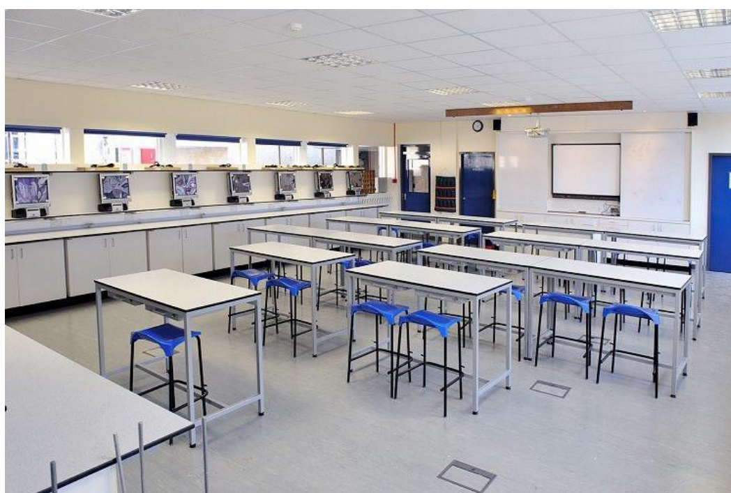
Fig.1. Specially equipped training laboratories.

at least two academic hours in general education disciplines, academic disciplines of the general humanities and socio-economic, general mathematical and natural science cycles - at least one academic hour [11].