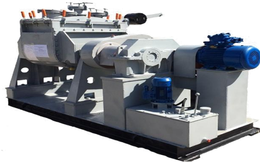
Fig. 1. General view of a twin-shaft mixer.

Twin-shaft mixers of the VL-400-VRU type are critical equipment in industrial processes involving the preparation of special mixtures (refractory, acid-resistant). The specifics of the process—frequency of operation, the need for precise shaft positioning for loading/unloading, and the large inertial mass of the mixture—place stringent demands on the electric drive.