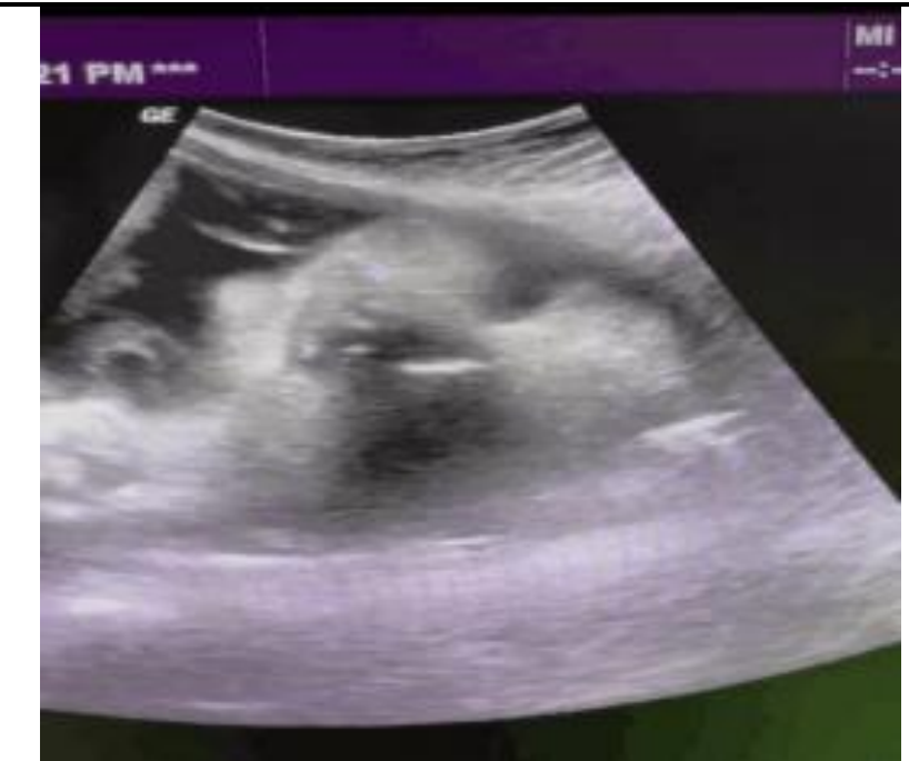
2. Pregnant N. (birth history №1890). Diagnosis: Pregnancy II 33.4 weeks. FGRS II degree. Circulatorye blood circulation disorders of the fetoplacental system are 2b degrees. The buccal coefficient is 8 mm.

The frequency of detection by ultrasound markers in the clinical groups was as follows (Table 2). A head index <71% indicated a dolichocephalic shape of the fetal head and was found in 9 (10%) cases in the main groups, while a head index >87% was found only in 9 (10%) cases in the main groups. brachycephalic shape of the fetal head. Therefore, these indicators are not effective for FGRS. In addition, in the control group, more than 87% were detected in 2 (6.7%) cases and less than 71% in 1 (3.3%) case, which can be explained by the constitutional specifics of the skull configuration in fetuses.