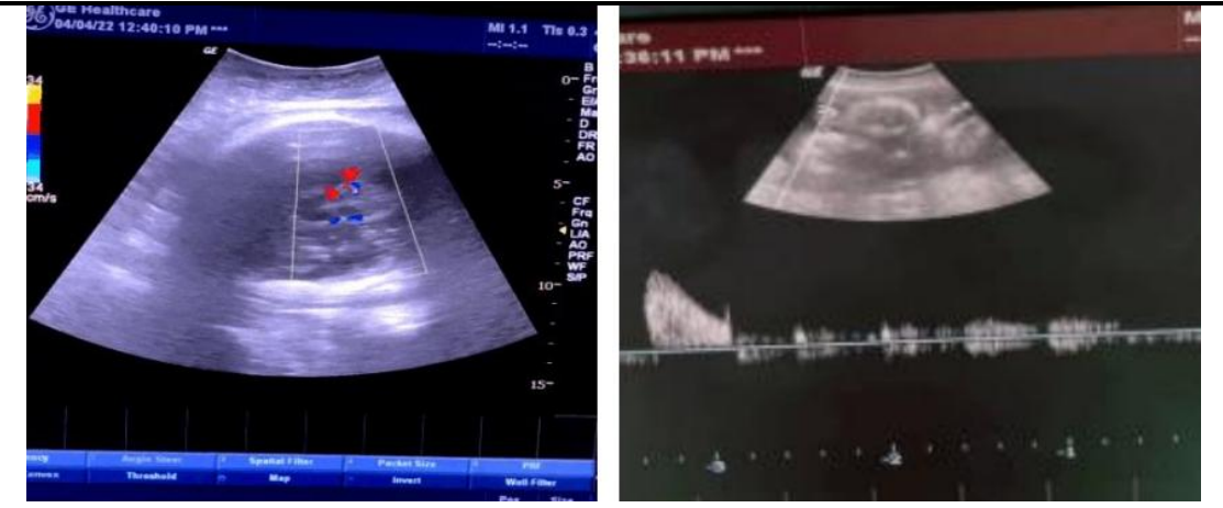
Pic.4. Hemodynamic disorders of the fetoplacental complex (UA, PA) on Doppler analysis

According to the results of a Doppler study of blood flow in the uterine arteries in pregnant women examined in the third trimester, the values of systole of diastolic ratio (SDR), resistance index (IR), pulsation index (PI) in the uterine arteries of the main group of patients in all the studied periods were significantly higher compared to these values in pregnant women of the control group. In the main group, 6 pregnant women had severe violations of fetal blood flow in the period from 32 to 36 weeks of gestation. In these disorders, the SDR in the umbilical artery has no mathematical significance, and since the IR is always equal, only PI is shown. In the main group, the average PI of the umbilical artery was 2.16 \pm 0.15 (p < 0.05) in patients with acute fetal blood flow disorders. According to Doppler measurements in the umbilical arteries of patients in the main group, SDR was 42-61%, IR - 16-39%, and PI - 33-98% higher than in pregnant women in the control group. Doppler blood flow in the middle cerebral artery in the fetus of the examined pregnant women showed a significant decrease in these indicators compared to the control group in the main group of women (Table 3).