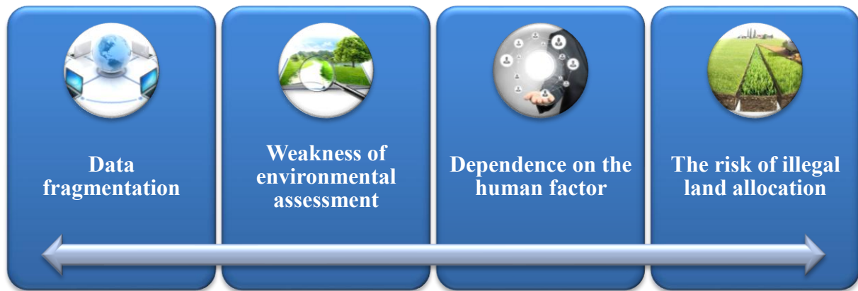
Figure 1. Problems with changing land classification.

Let's look at a comparison of the traditional and automated systems (Table 2).