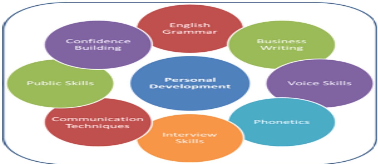
Image 2. Personal Development.

Understanding English grammar is fundamental to effective communication. It provides the rules for constructing clear and meaningful sentences, ensures accurate time expression through tenses, and allows for precise punctuation that aids in understanding. By mastering grammar, individuals can enhance their speaking and writing abilities, avoid common mistakes, and present their ideas with greater clarity and confidence. Therefore, a solid grasp of grammar is not just a requirement but a valuable skill for success in the modern world.